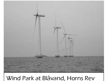
Wind Park at Blåvand, Horns Rev

Sunday morning, we will return on an early morning train. Arrival in Copenhagen is in time to catch the mid-afternoon Icelandair connection to Boston, where we arrive in the early evening. Or you can select an option to stay longer in Copenhagen or Reykjavik, Iceland, or both, on your own, even visiting other European cities before returning to Boston via Icelandair from a choice of major cities at no additional airfare.